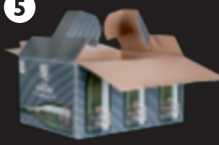
Closure-1 st phase Bottle retainer cover