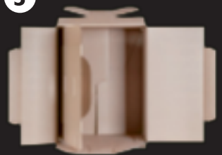
3 bottles are placed on bottom and integral separator is folded on top of them