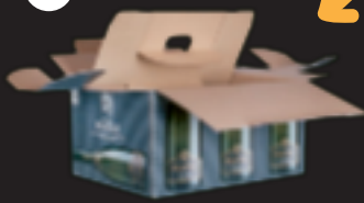
3 bottles are placed on top of the separator