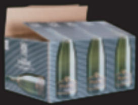
Closure-2 nd phase Self-locking cover